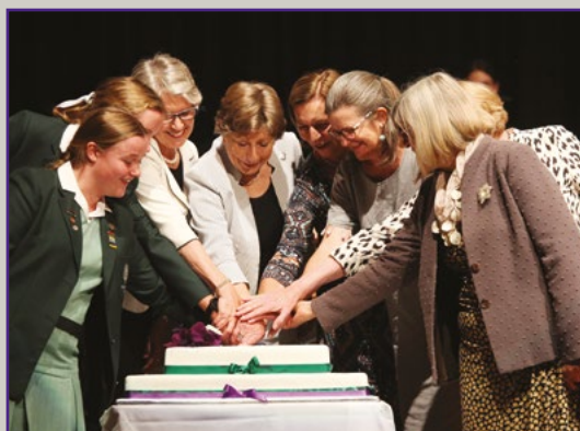
Cake-cutting by past Presidents of Fellowship and Head & Vice Head Girls at the Centenary Service & Celebration.