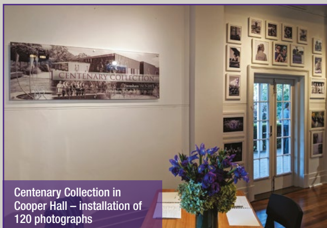
Centenary Collection in Cooper Hall – installation of 120 photographs