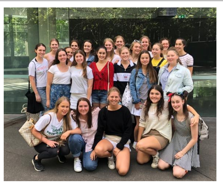
Senior Drama at the Belvoir Theatre