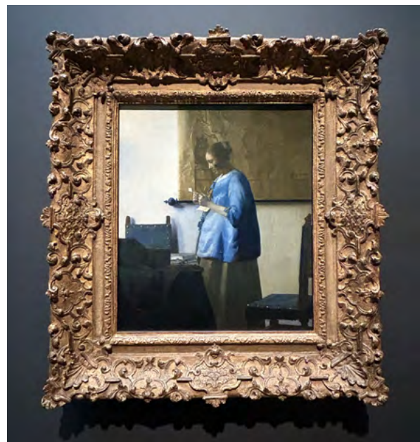
Vermeer's Woman Reading a Letter in the Rijksmuseum, Amsterdam