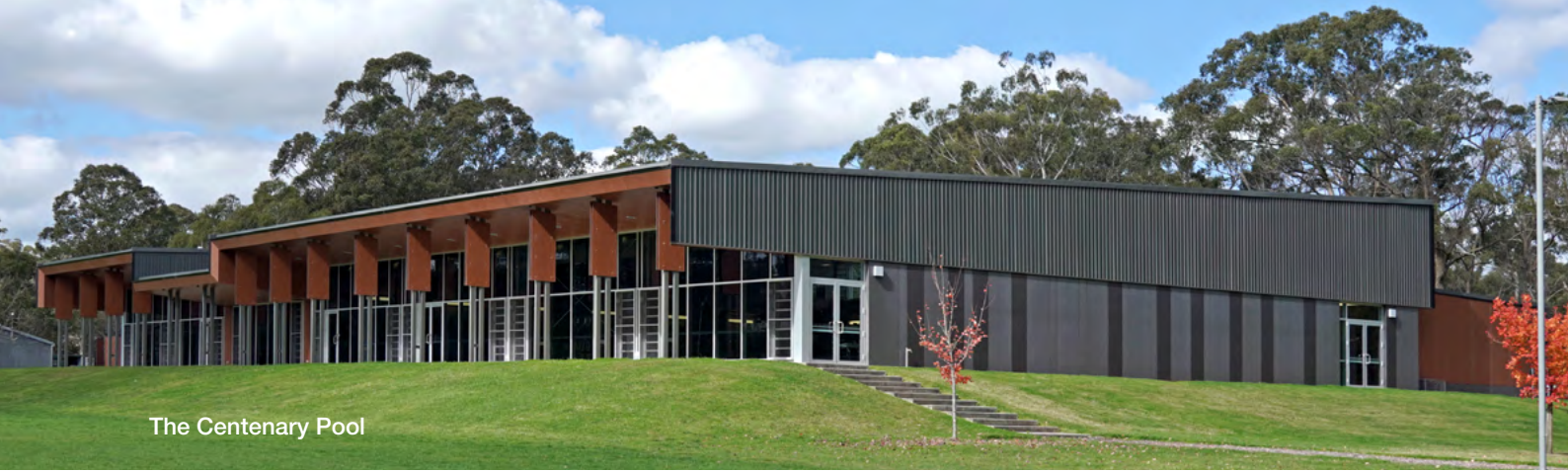
The Centenary Pool

Previous contributions have helped to fund the state-of-the-art Centenary Pool, benefiting students from Preschool to Year 12, as well as a number of other major building projects at both Frensham and Frensham Junior School.