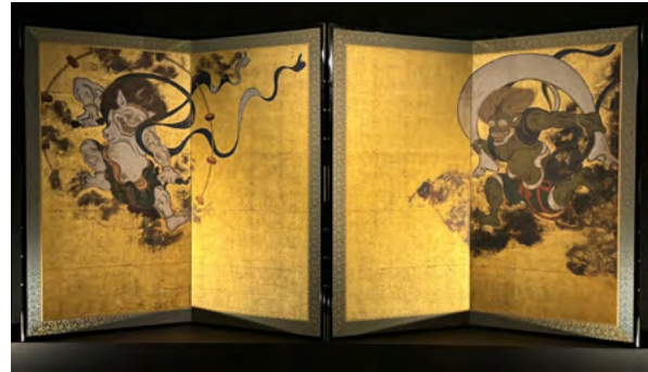
Fujin and Raijin and Twin Dragons in the Kennin-ji temple

800 years ago. My major work at Frensham was largely composed of ink paintings, and it was exciting to see a masterwork that dwarfed me in size, yet retained intricate detail, celebrating a long history of brush painting.