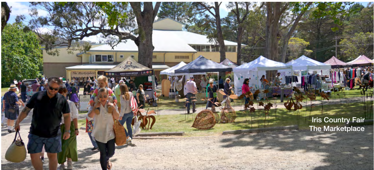
Iris Country Fair The Marketplace

Each of the events held this year symbolised the vibrant and positive culture of philanthropy that is growing at our school.