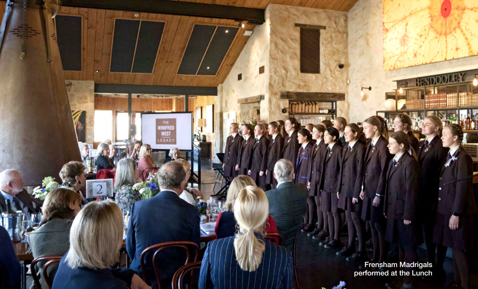
Frensham Madrigals performed at the Lunch