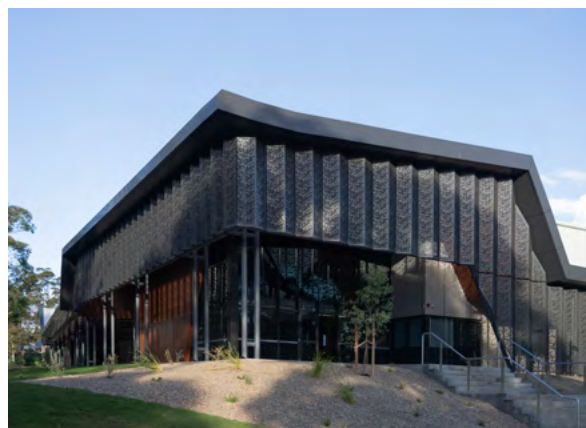
Frensham School's latest project is the Frensham Sports Hall

Frensham Schools relies on fundraising to bridge the gap between operational costs and the additional expenditure needed for infrastructure improvements.